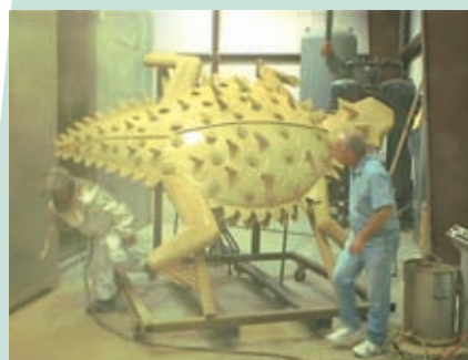
Old Rip gets inspected before final cure.