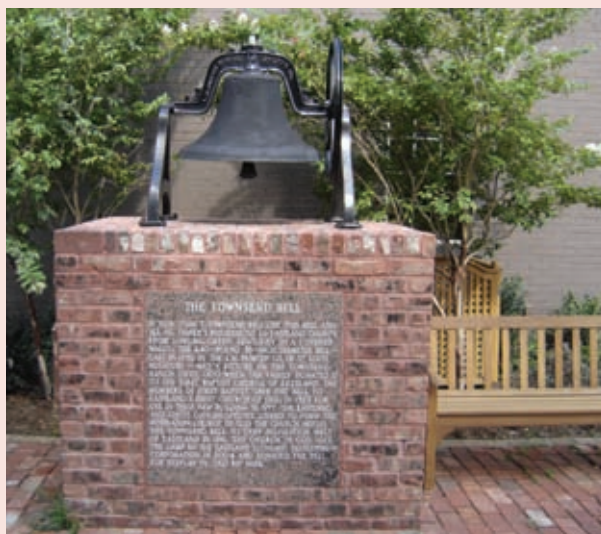
Powder coating preserves the 156-year-old Townsend Bell for posterity.

T he Townsend Bell (hanging frame only) was powder-coated and restored at the same time as Old Rip the horned toad in June 2005. This monument is also in Old Rip Park.