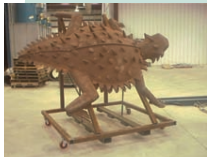
Weathered Old Rip on a steel rack made specially for him.