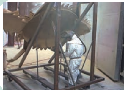
A TGIC-based polyester powder coating will protect Old Rip in the Texas heat.