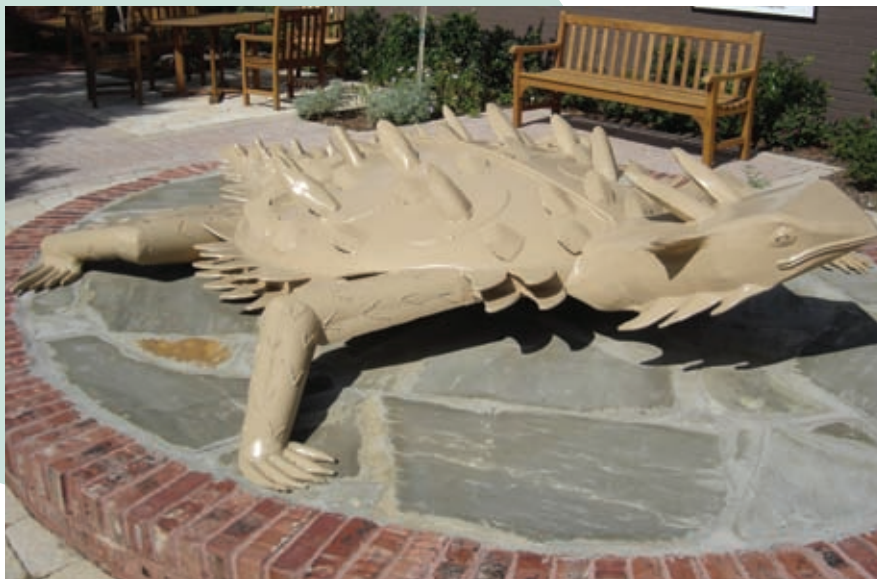
Old Rip reigns as the Eastland city symbol in the park bearing his name.