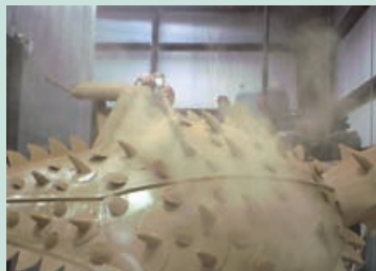
Old Rip had a lot of Faraday cage areas to coat.