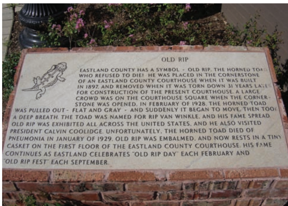
The Old Rip Memorial Plaque tells the tale of the indestructible horned toad of Eastland, Tex.

In May 2005, EBAA Iron started a new powder coating line designed to handle heavy steel parts weighing up to 10,000 pounds. That's how the company became involved in the restoration of Old Rip as well as the Townsend Bell, another part of Eastland's history (see sidebar). With the approval of the artist, the sculpture was powder-coated to better suit its new purpose.